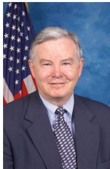
The Honorable Joe Barton Congressman 6th District of Texas